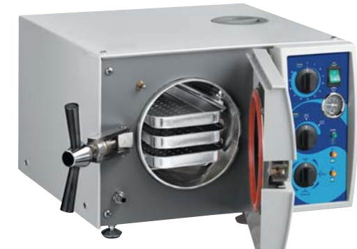
*Come up time, sterilization exposure and exhaust