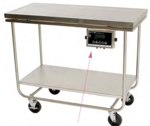
Regal 300 Electronic Scale lets you weigh patients anywhere.

*See Electronic Scales Section for information on the Regal 300