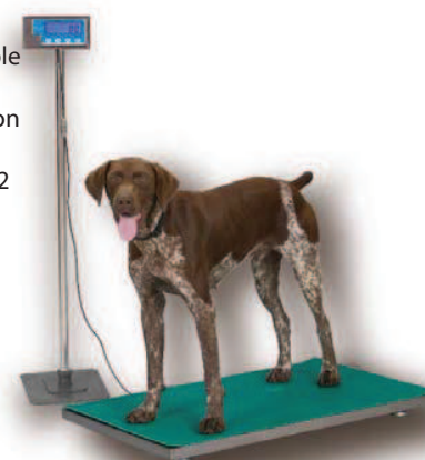
PS500 Shown with optional indicator stand