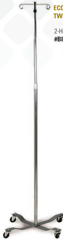
ECONOMY TWIST LOCK

Two or four hooks available for 5-Leg base!