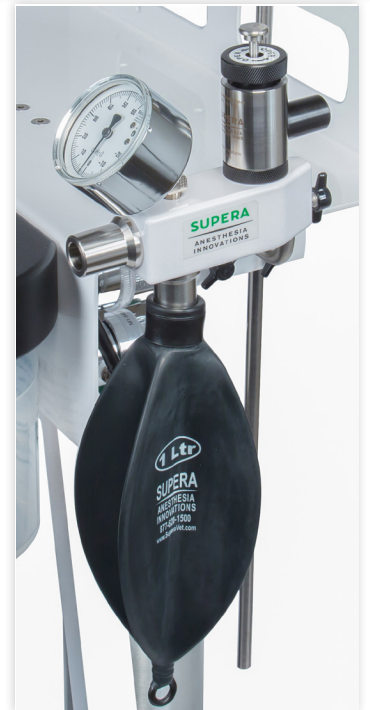
Optional Universal Control Arm Manifold for Bain Circuits P/N NA2013

Note: Vaporizer not included. Sold Separately