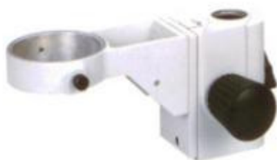
FS03 - Ball Bearing Pole Mount Arm