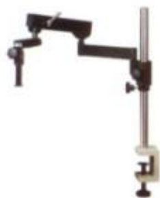
1109 Articulating Arm Boom Stand