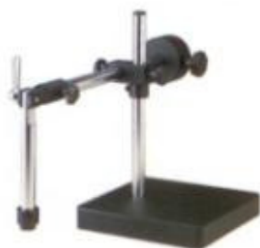
1105S Special Universal Stand