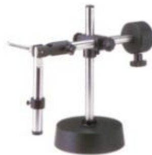
1105 Universal Stand