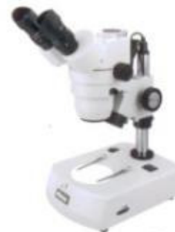
SMZ-143-N2GG Trinocular Stereomicroscope