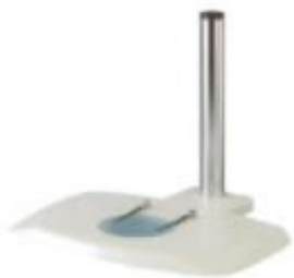
2112 Large Working Area Incident Illumination Stand