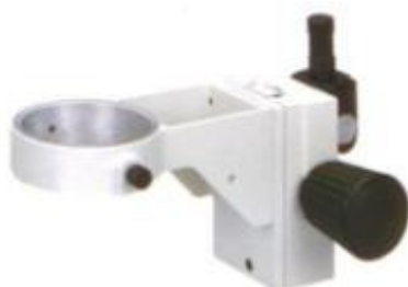
FI01 - Industrial Arm