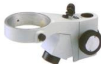
FS02 - Pole Mount Arm with Illumination