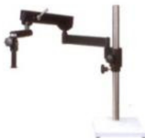
1107 Articulating Arm Boom Stand