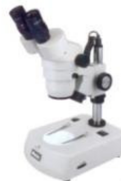
SMZ-140 (60)-N2GG Binocular 60° Observation Stereomicroscope