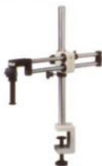
1110 Ball Bearing Boom Stand