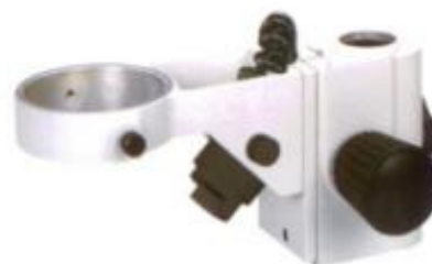
FS04 - Ball Bearing Pole Mount Arm with Illumination