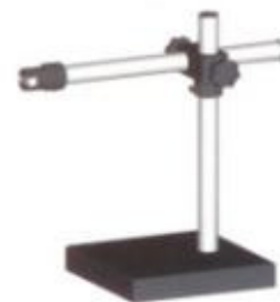
2105I Industrial Arm Boom Stand