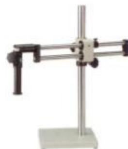
1108 Ball Bearing Boom Stand