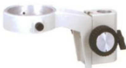
FS01 - Pole Mount Arm