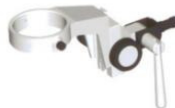
FI02 - Fast Release Industrial Arm