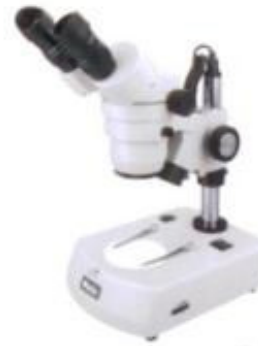
SMZ-140-N2GG Binocular Stereomicroscope