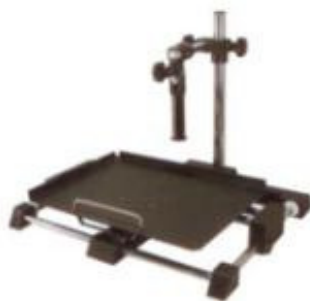
Manual Movement Stand