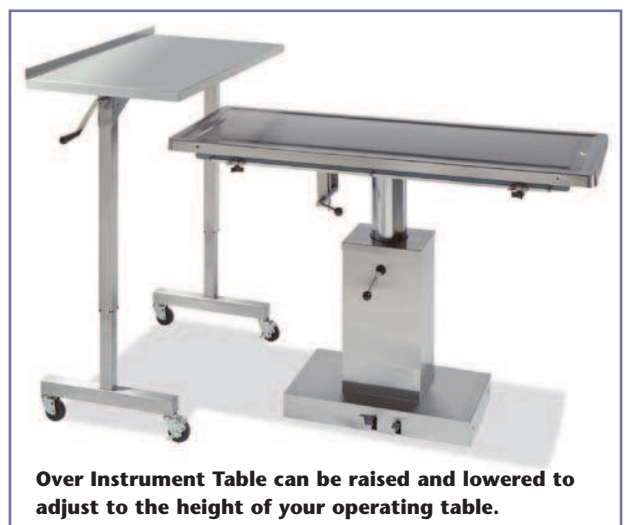
Table top surface measures a full 40-in. long x 23-in. wide (101.60cm long x 58.42cm wide) to hold an assortment of supplies. And the raised back rail keeps equipment from sliding off accidentally. Rolls smoothly on 3-in. (7.62cm) diameter non-marking casters to allow you to move Table into position easily. Two casters have brakes for safety.

Use this Table to keep surgical instruments, supplies, even monitoring equipment conveniently close at hand during procedures. Manufactured entirely of durable Type 304 stainless steel, our Over Instrument Table features a mobile telescoping base for versatility. Plus, our conveniently-designed crank operates from either side of the Table to raise top height from 39-in. to 62-in. (99.06cm to 157.48cm).