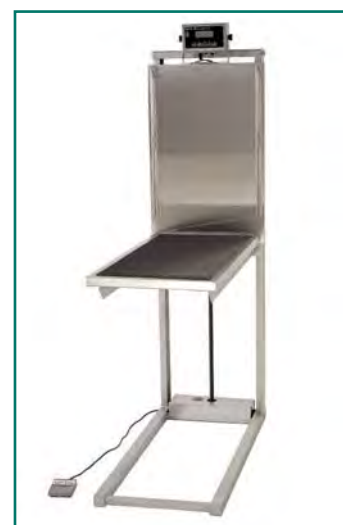
Elite Floor-standing Lateral, Regal 300 Electronic Scale Lift Table