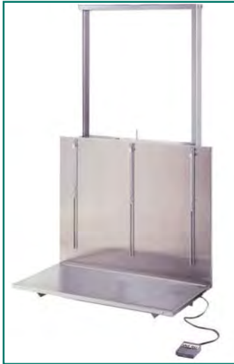
Elite Wall-mounted Longitudinal Lift Table