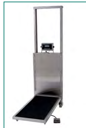
Elite Wall-mounted Longitudinal, Regal 300 Electronic Scale Lift Table