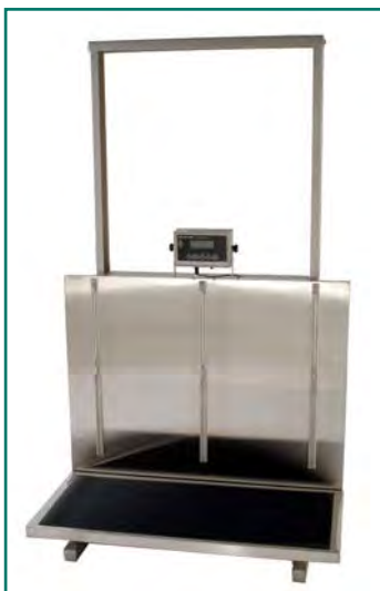
Elite Floor-standing Longitudinal, Regal 300 Electronic Scale Lift Table