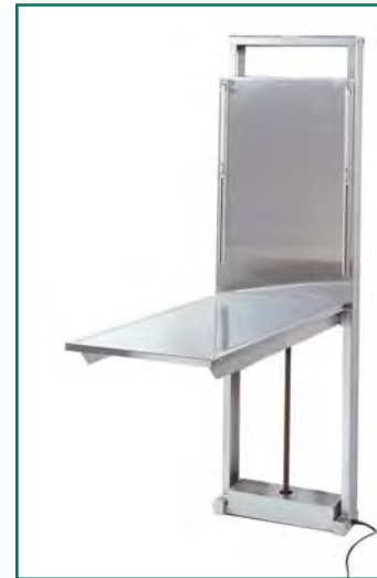
Elite Wall-mounted Lateral Lift Table