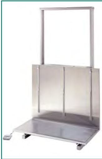
Elite Floor-standing Lateral Lift Table