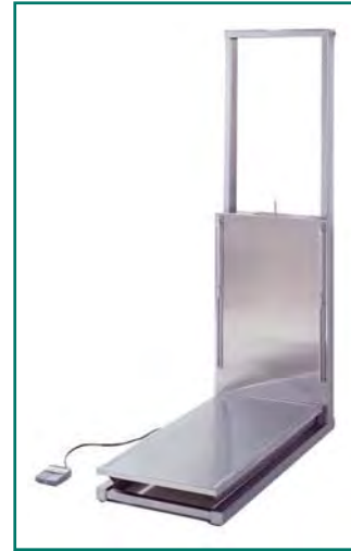
Elite Floor-standing Longitudinal Lift Table