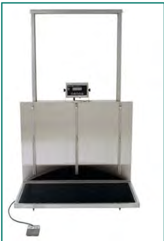
Elite Wall-mounted Lateral, Regal 300 Electronic Scale Lift Table