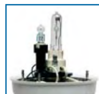
Primary and Secondary Bulbs

The next level in the evolution of surgery lighting has been achieved with the new MH (High Intensity Discharge) Series . This all new design heralds a notable increase in efficiency over traditional halogen light sources, producing over 100,000 lux output with only a 39 watt H.I.D. bulb, versus a 150 watt halogen bulb! Heat has been virtually eliminated, while color temperature has been significantly increased to over 4,300° Kelvin. Additionally, the MH light boasts a rated bulb life of over 10,000 hours and includes complete mechanical dimming, the most accurate method.